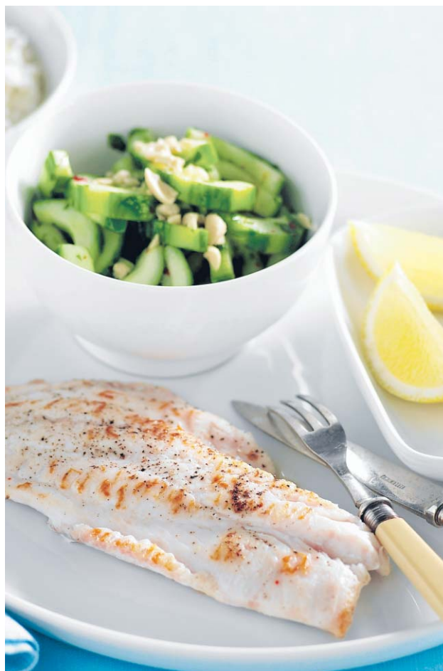
Healthy option: Barbecued fish with spicy cucumber salad.