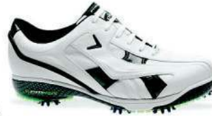
Twenty-seven Names 'In Paris' small bag , $157.50. Callaway Hyperbolic Golf shoes , $279. Huffer 'check it' cap , $69.