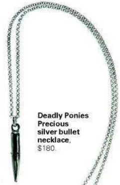
Deadly Ponies Precious silver bullet necklace , $180.