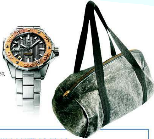
TAG Heuer Aquaracer , $6750, from Partridge Jewellers.